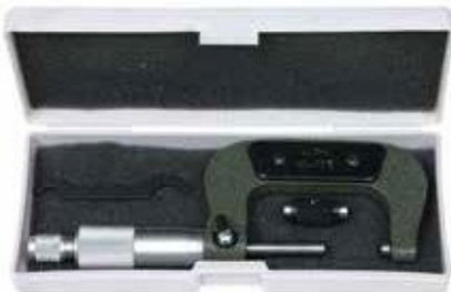
MEAM-W1510 | 0 - 25mm