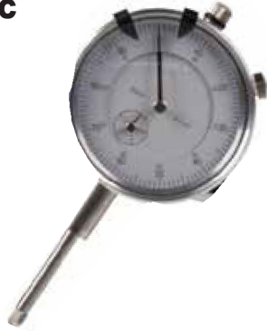
MEAD-W1522 | 10mm x 0.01mm