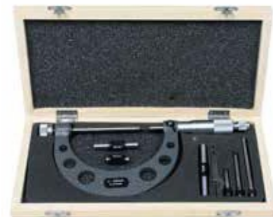
MEAM-W1514 | 0 - 100mm