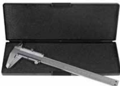
MEAC-W1501 | 6" x 1/16th Increments