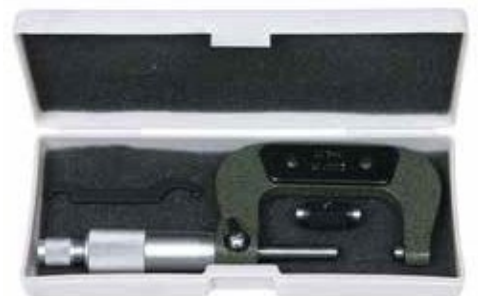
MEAM-W1508 | 0 - 1"