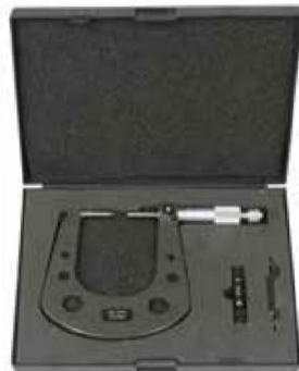
MEAB-W1519 | 7.6mm - 33mm