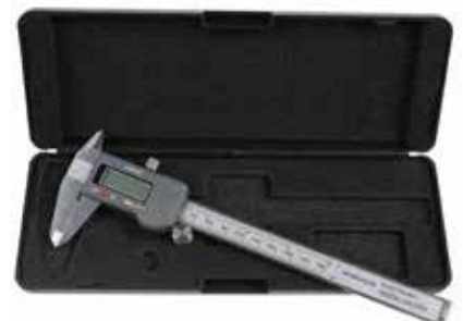
MEAC-W1504 | 6"