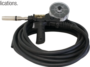
SUREGRIP SP24 200 AMP