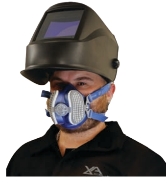
WELDING HELMET NOT INCLUDED