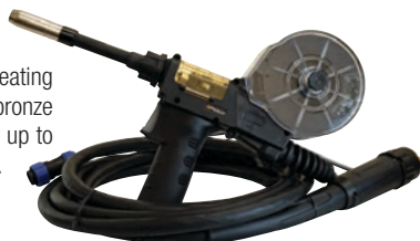
SUREGRIP SP15 150 AMP