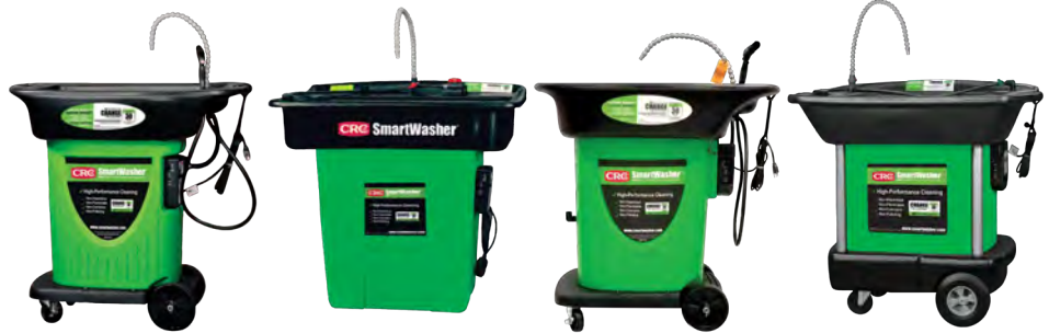
SW-23 Mobile Parts/Brake Washer